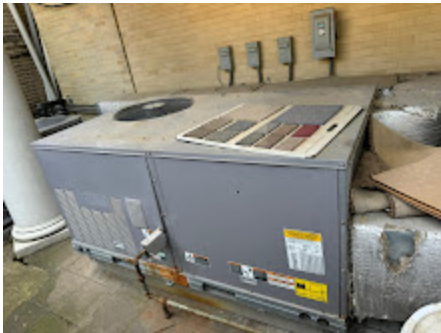
EQUIPO EN PLANTA BAJA 3.jpeg 282K