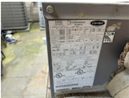
EQUIPO EN PLANTA BAJA.jpeg 214K