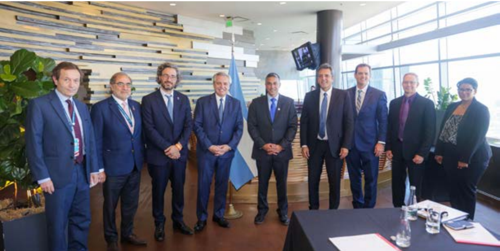
President Alberto Fernández (Ctr.), officials of Argentine Administration and executives from General Motors.

IN THE KNOWLEDGE-BASED SERVICES SECTOR THERE ARE 500 COMPANIES IN THIS FIELD AND 11 UNICORNS: MERCADOLIBRE, DESPEGAR, GLOBANT, OLX, AUTH0, VERCCEL, ALEPH HOLDING, MURAL, BITFARMS, UALÁ AND TIENDANUBE.