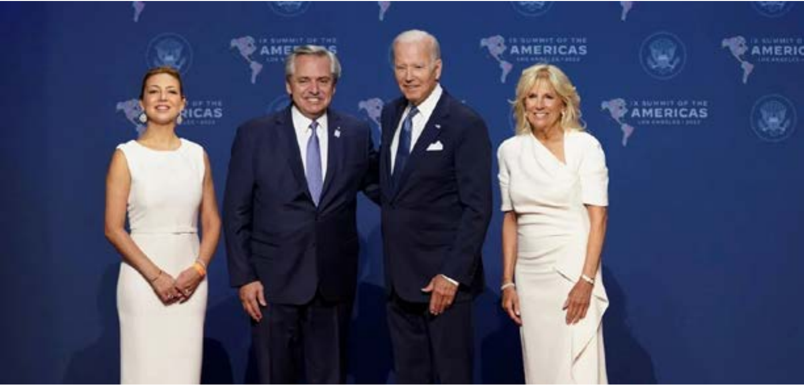
(From Left to Right.) Fabiola Yáñez, Presidents Alberto Fernández and Joe Biden (Ctr.) and Jill Biden.