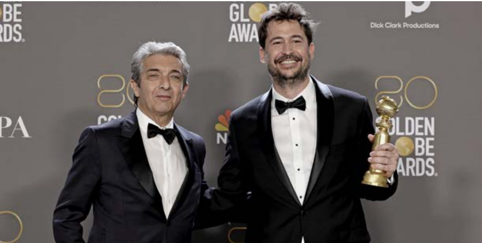
"Argentina, 1985", Golden Globe for best foreign film. Ricardo Darín, starring, and Santiago Mitre, the director