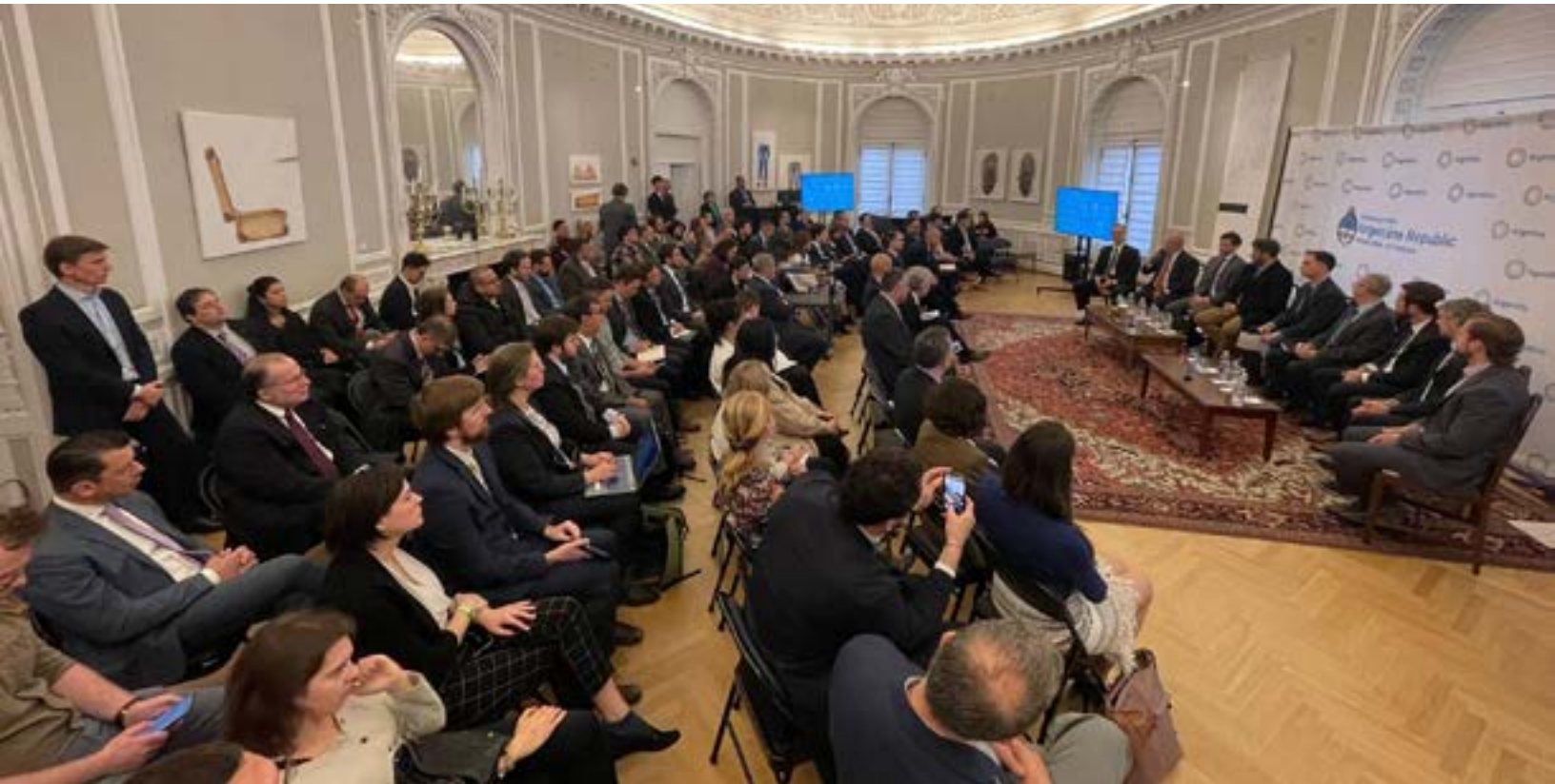
National Space Day at the Embassy.