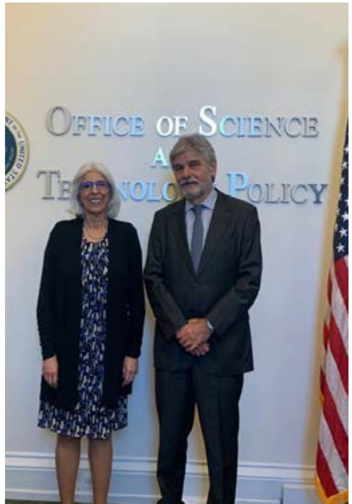
Director Arati Prabhakar and Minister Daniel Filmus at the White.

Lastly, the head of the Science, Technology and Innovation portfolio took advantage of the opportunity provided by this visit to meet with Argentine researchers working at different universities and scientific agencies in the U.S., and also gave a conference on Argentina's national innovation system at John Hopkins University in Baltimore. ■