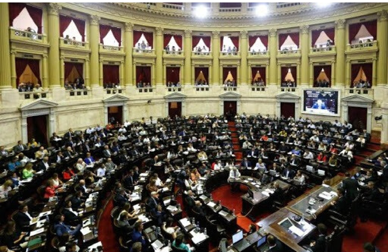
Minister of Economy of Argentina, Mr. Martín Guzmán addressing the Congress of Argentina. 02/12/2020

ALTHOUGH ARGENTINA HAS MADE AN OFFER IT REMAINS FLEXIBLE TO INCORPORATE VARIATIONS WITH THE AIM OF ENHANCING ITS VALUE, IN THE CREDITORS' PERSPECTIVE