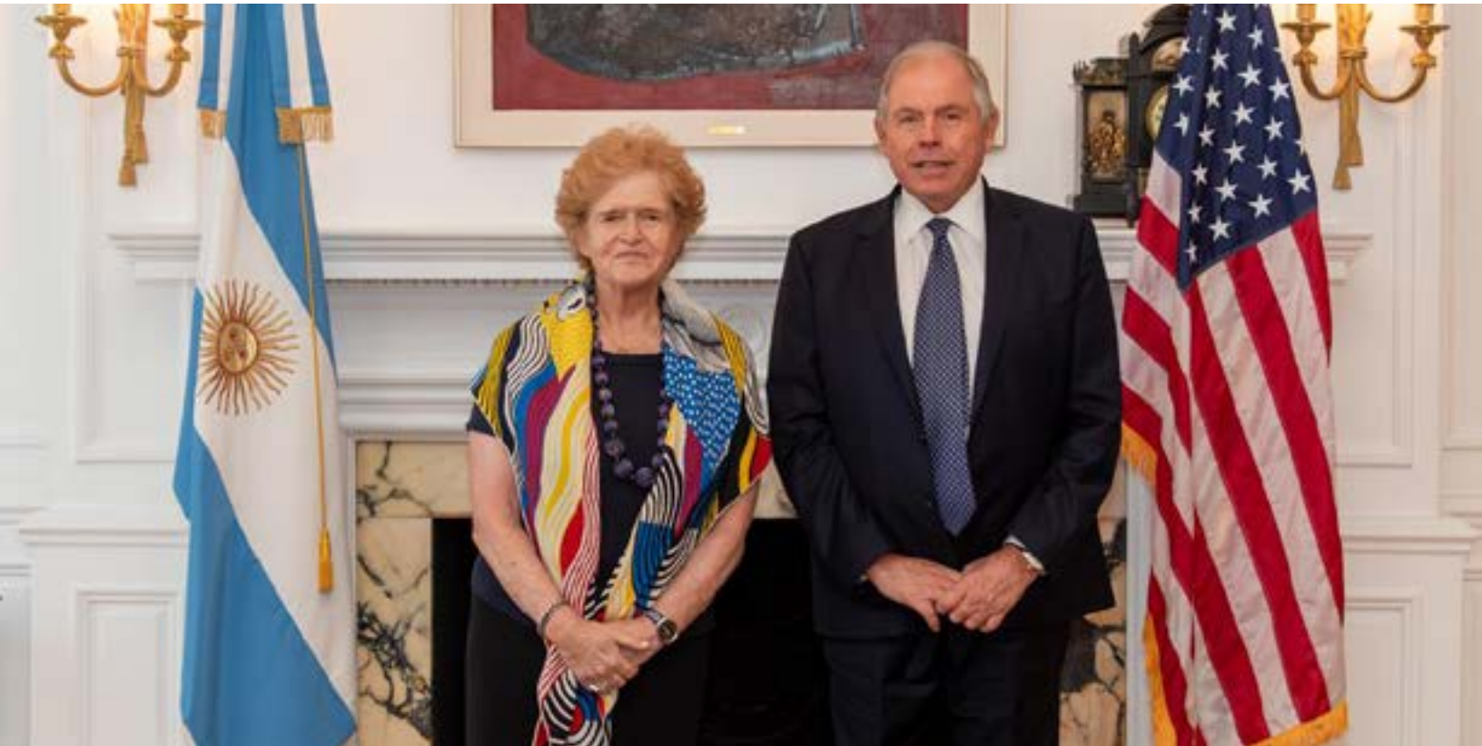
Ambassador Gerardo Werthein with State Department's Special Envoy Ambassador Deborah Lipstadt.