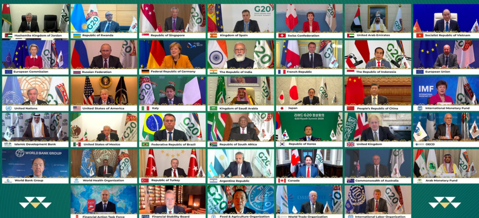
G20 Leader's Summit, November 21-22, 2020