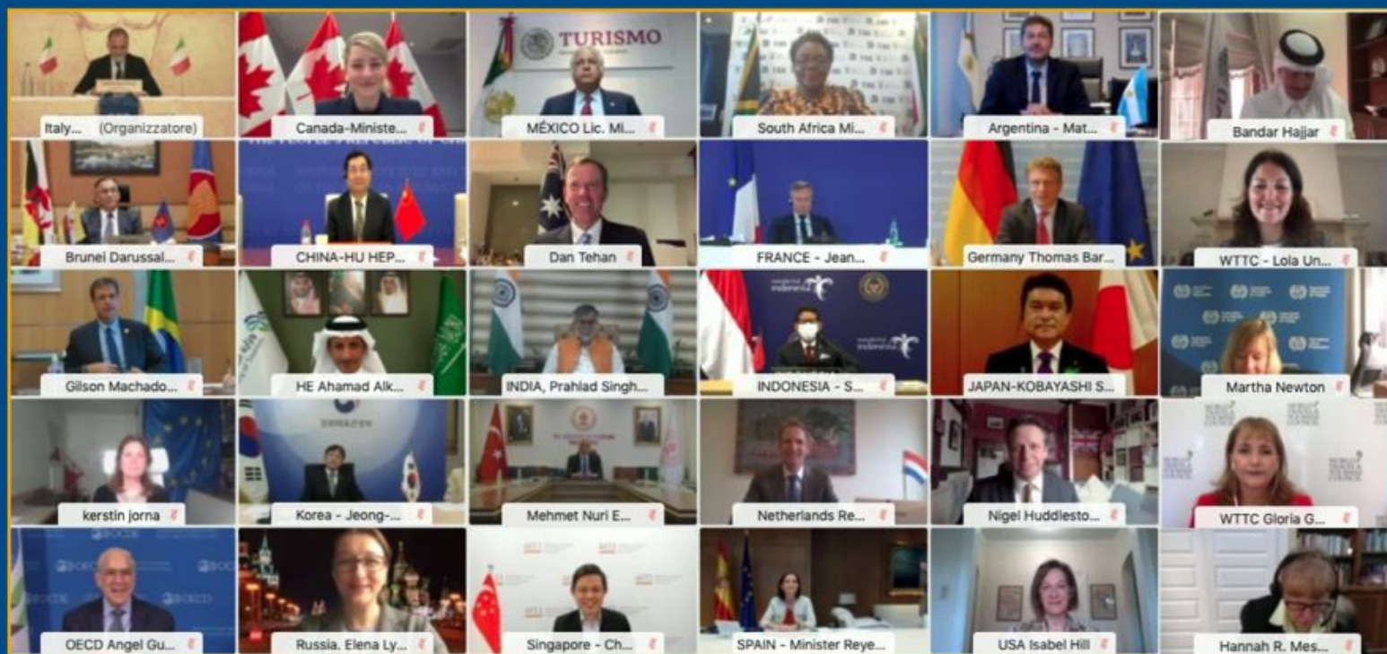
The G20 Tourism Ministers Summit.