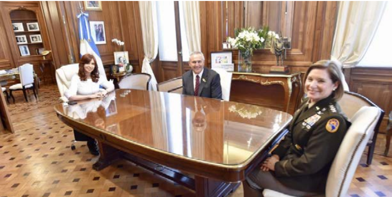
Vice President Cristina Fernandez de Kirchner (left), Ambassador Marc Stanley (center), General Laura Richardson (right).